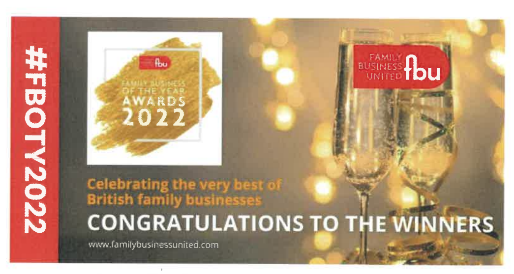
Home > Editors Pick > #FBOTY2022 Winners Announced

Understanding Business Travel Expenditure